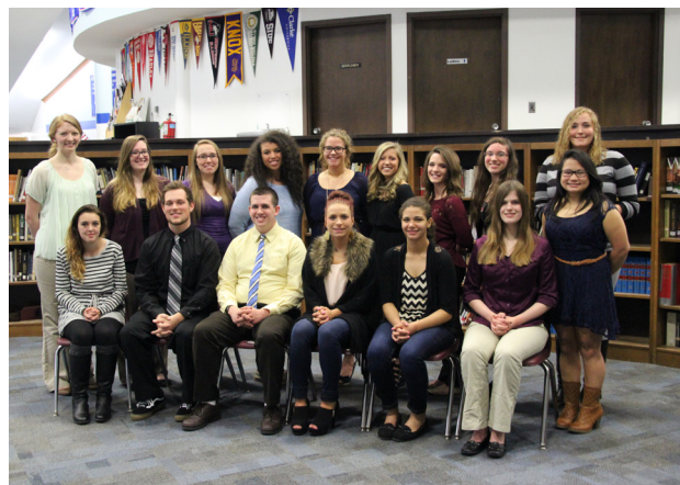
The 2014-15 National Honor Society inductees.