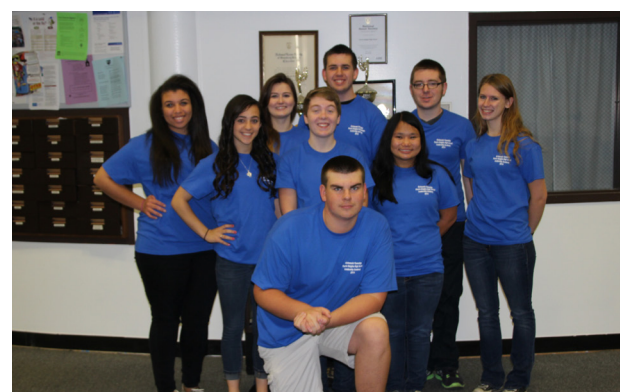
The inaugural Student Leadership Academy!