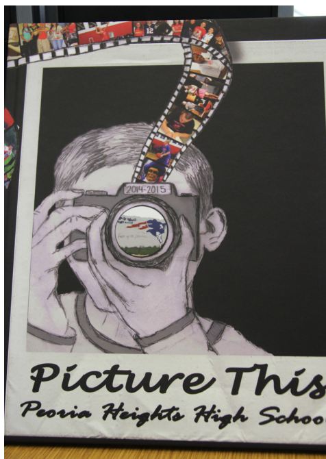
The yearbooks are finally in! If you didn't get one, some are still available in the office for $50!