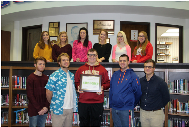
2015 Yearbook staff are here with the award won for last year's yearbook