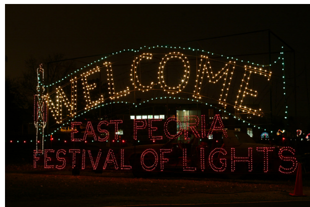
Folepi's Winter Wonderland, also known as the East Peoria Festival of Lights, is one of the most popular holiday attractions in Illinois

Christmas time is near! I can speak for a lot of people when I say Christmas is their favorite time of the year. There are many great activities to do during Christmas time here in Peoria, including some new ones. The Festival of Lights is always a great thing to do during this holiday season. It's held at Fondulac Park in East Peoria and it's always a great time and I recommend it to everyone. Another great activity to do this Holiday is check out the new ice skating rink down by the Civic Center. I went there within the first few days it opened and it is definitely a pleasant time! This is not all there is to do this holiday season, but these are for sure some fun ones.