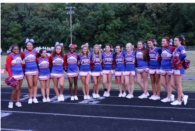
2016 Cheer Team

The dance and cheerleading teams are hard at work in preparation for basketball season. They are both planning and learning new routines for games and the winter sports pep assembly. The assembly will be in mid- January, and I'm sure both teams will have something great planned! The dance team will perform for the first time this basketball season at next Friday's home game. Come out and support both teams!