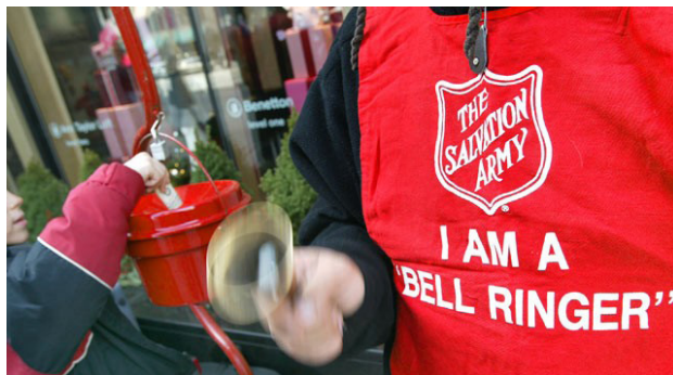
Salvation Army red ketties are one of many donation opportunities during the holidays.