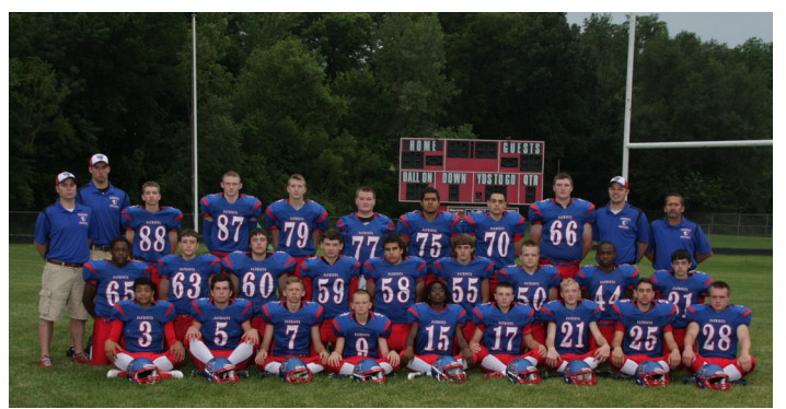
The 2014 PHHS varsity football team.

The team opened the season at Ridgewood on Friday. The team waited out a lightning delay but fell 33-0. They host Princeville Friday in their home opener.