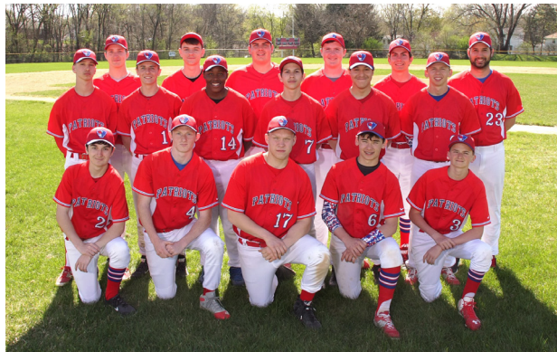
The 2015 Peoria Heights Patriots Baseball team.