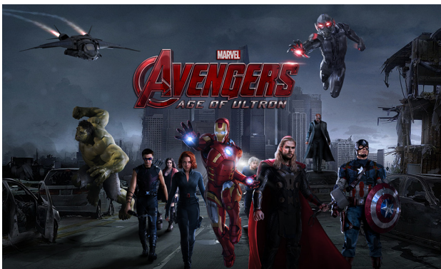
Avengers Age of Ultron poster.

Many people have been really excited for the summer. Not just to be out of school, and to wake up at 12 every day, but also to watch some awesome movies. Opening the summer season, The Avengers: Age of Ultron , on Friday. Jurassic World is coming out on June 12 th , Ted 2 comes out June 26 th , Insidious comes out June 5 th , and The Fantastic Four comes out August 7 th . From my point of view, Jurassic World looks like it is going to be a great movie. It stars Chris Pratt and Bryce Dallas Howard. Keep reading the Towncrier for more updates about the school year and the summer!