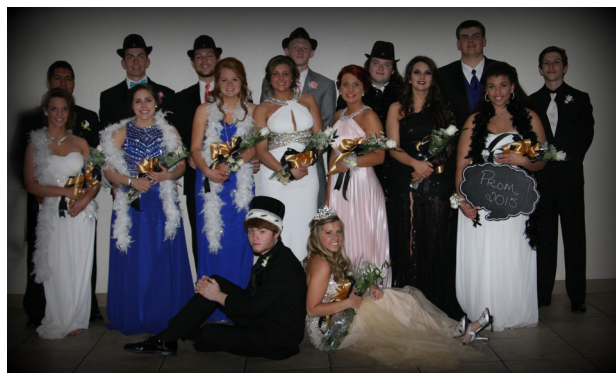
The Prom 2015 court.