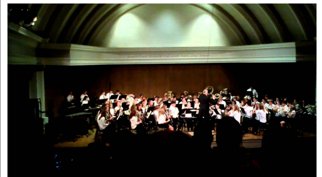
The 2012 honor band.