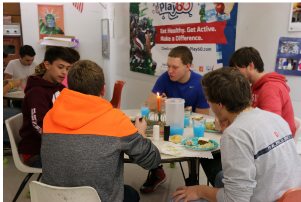
PHHS students feast for Thanksgiving.