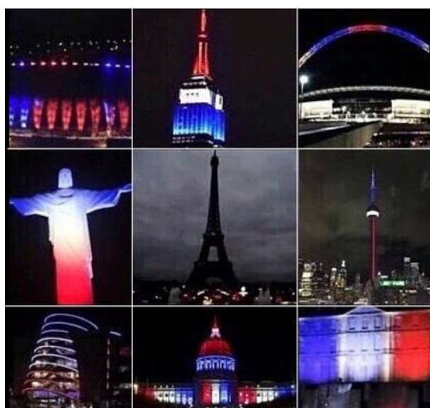
Monuments all around the world light up in support for Paris, while the Eiffel Tower goes dark in mourning.