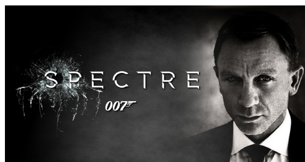
A movie poster for Spectre.

On Friday, November 6 th , the new James Bond movie was released. Spectre , which is the fourth movie with Daniel Craig playing James Bond, was a big hit at the box office, bringing in more than $70 million in the first weekend. The movie, held together with that classic James Bond theme, had many twists and turns. While keeping its James Bond originality, the movie showcased the newest gadgets and devices available in the James Bond world, including the newest sports car to be added to the 007 series, the Aston Martin DB10. What should you expect out of the movie? High action, flipping cars, and chase scenes can all be expected out of Spectre . The movie was a big hit with critics and viewers, and I would highly suggest going to see it!