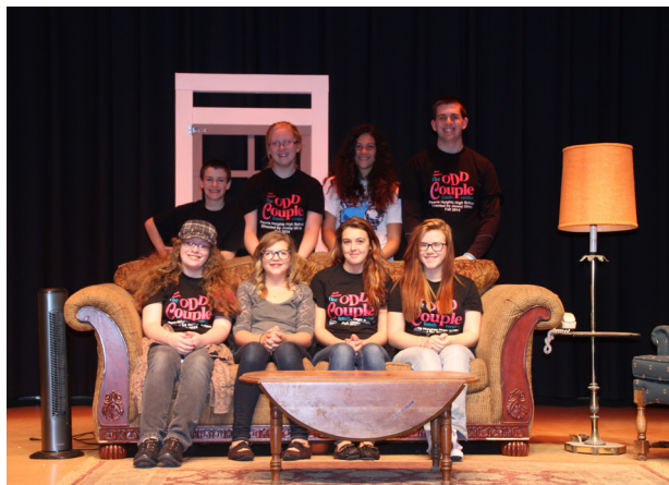
The 2014 play cast.

The Odd Couple is a well-known play that has been performed in local theaters, such as the Peoria Players or Cornstock, on bigger stages, such as on Broadway, and it even had its own TV show from 1970 - 1975. Last Friday, on November 7 th , our high school put on a lesser known version of the play, The Female Odd Couple , which stars two girls instead of two boys. It was put on over at the Grade School, and it was a huge success. We had over 100 parents and students attend our play, and it was greatly enjoyed. If you missed it, don't fret! The Grade School play will be put on in the spring, and there is always next fall for the High School play. Great job to the cast on their performance, and we can't wait to see the play next year!