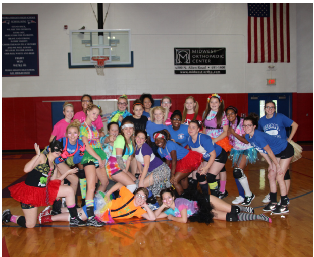
The volleyball team held a whacky-tacky practice to recognize the season's end.

JV has had 6 wins throughout our season, so they've had a pretty successful year. On the other hand, varsity captured our first win against Manuel during the Princeville tournament. Yesterday was the first day of Regionals at Williamsfield, and we took on Delavan. The Lady Patriots came up short, but like always, we fought until the end.