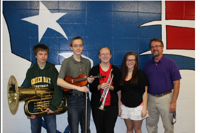
The group of ILMEA students.