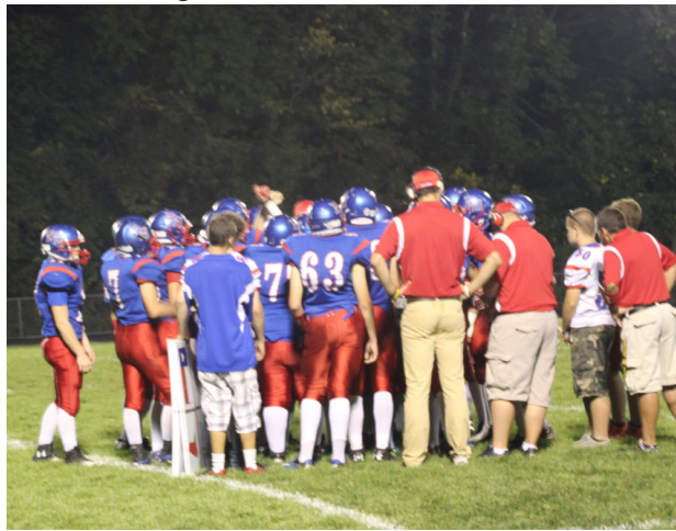
The varsity team huddles up during a timeout.

In week 6, the Patriots traveled to Abingdon to take on the Tornadoes, one of the best teams in the state. Abingdon won to remain undefeated. The Patriots host North Fulton tonight.