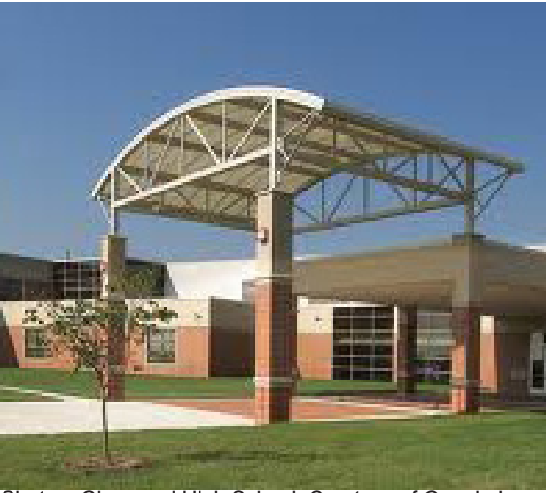
Chatham Glenwood High School.

Last week the journalism class went to a yearbook convention at Glenwood High School. The school is located in Chatham, IL. Once we walked in, it was like we were in a new world. We obviously aren't used to normal looking high schools, with a normal number of people in their school. One student quoted, "I feel like I'm in college." Several different schools around Illinois were at the convention as well. One of the best parts was the free donuts, if you ask me. The day was filled with different workshops, giving tips on yearbook designs, ad sales, and etc. We got a lot of tips and ideas on how to make our yearbook even better than it already was. We can't wait to get started on this year's yearbook! I hope the future journalism classes continues to make this field trip every year. It's a very educational trip that every journalism staff member should experience.