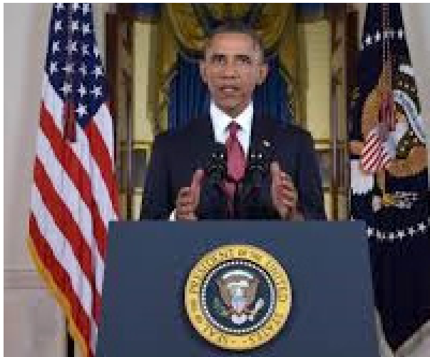
President Obama speaks out against ISIS.

Islamic State in Iraq and Syria (ISIS), mainly a Sunni jihadist group, seeks to sow civil unrest in Iraq and the Levant with the aim of establishing a caliphate a single, transnational Islamic state based on sharia. The group emerged in the ashes of the U.S.-led invasion to oust Saddam Hussein as al-Qaeda in Iraq (AQI), and the insurgency that followed provided it with fertile ground to wage a guerrilla war against coalition forces and their domestic allies. The rebellious group was launched by Abu Musab al-Zarqawi, an Arab of Jordanian descent, and flourished in the sectarian tensions that followed the U.S.-led invasion of Iraq in 2003. By June 2014, the group's fighters had routed the Iraqi military in the major cities of Fallujah and Mosul and established territorial control and administrative structures on both sides of the Iraqi-Syrian border. ISIS is currently led by Abu Bakr al-Baghdadi, also known as Abu Du'a. The U.S. government believes he resides in Syria. According to ABC, the US has launched 334 airstrikes against ISIS — 248 in Iraq and 86 airstrikes in Syria. Article courtesy of www.abc.com