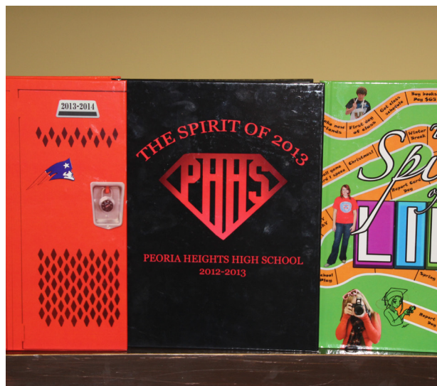
What will the next yearbook look like?

It's the start of a fresh year, and we are now starting on the 2015 yearbook. We are currently thinking of the theme we are going to go with. We have only a couple ideas, but we're getting there. This year's yearbook will be new, exciting & full of memories!