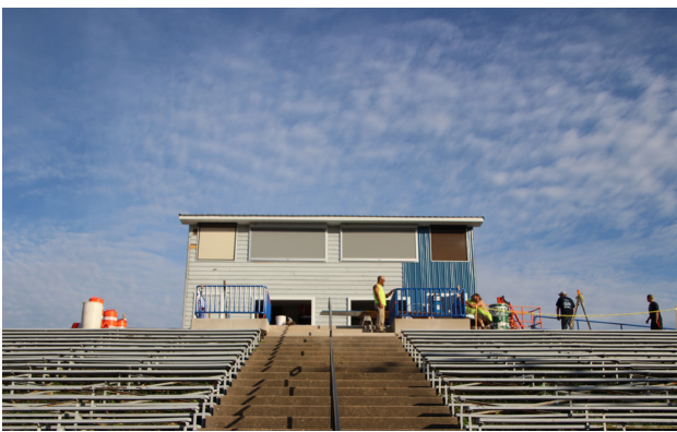
Work is still being done on the pressbox, but it is looking great!