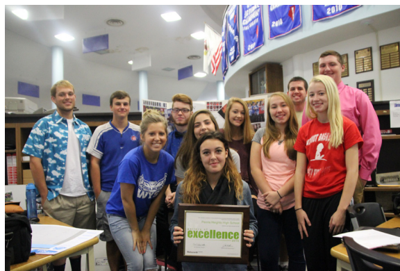
This year's yearbook staff poses with the Gallery of Excellence award.

Did you like last year's yearbook? The administrators of Walsworth seemed to love it! They had given the last year's staff with an award and inducted the yearbook into the "Walsworth Yearbooks' Gallery of Excellence." Yearbooks are selected based on the high quality of their design, coverage, copy, and photography. The yearbooks chosen are used as examples at regional, state, or even national conventions, as examples to help aid other designers. Congratulations to last year's staff on the outstanding work!