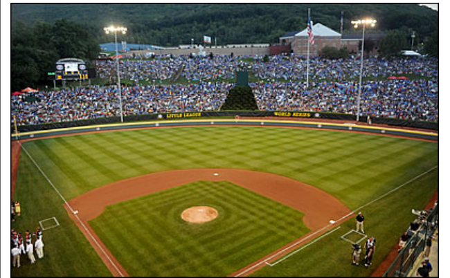
A shot taken from the stands at the Little League World Series.

world, they get to go on a vacation, and they get to play baseball on TV. The team from Texas played the team from Mexico for third place. Texas beat Mexico 6-4 for third place. In the championship game the team from Pennsylvania played the team from Japan. It was a high scoring game but Japan ended up winning 18-11.