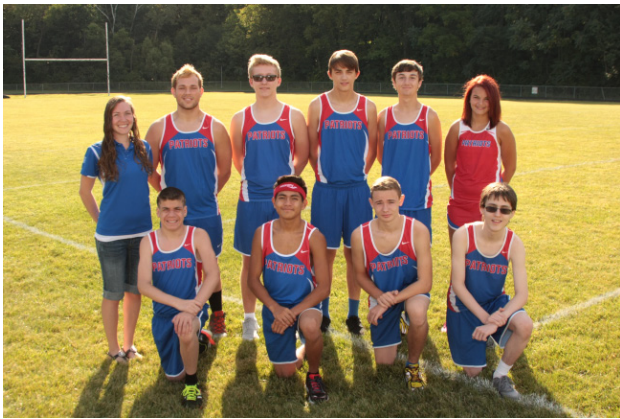
The 2015 Cross-Country team.