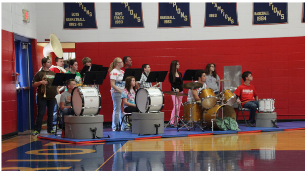
The PHHS band watches the pep-rally from the back and gets ready to play the school song.