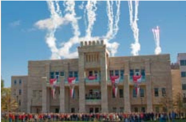
The alumni building after the opening ceremony a few years ago.

Every year around this time, Peoria Heights High School upperclassmen begin looking at colleges. However, some may overlook some of the great colleges we have close to home. A great example is Bradley University, located here in Peoria, Illinois. With an acceptance rate of 67%, Bradley University accepts around a thousand freshmen into its college each year. Bradley also has a 12 to 1 student to faculty ratio, and they have over 100 undergraduate programs spread across their five colleges. If you are looking for sports, Bradley does not disappoint. As a division 1 school, Bradley offers 15 varsity sports that each participate in the Missouri Valley Conference. Overall, Bradley University is a great college that is close to home. Keep Bradley in your mind as you search for the right college!