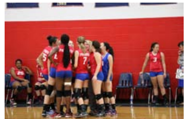
The volleyball team huddles up during a quick timeout.