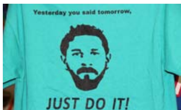
This year's new MOJO shirt!

Mojo is underway again for this year, and the first Mojo day is coming up quicker than you think. Next Wednesday, Freshmen will have their first Mojo day and it will be a blast. We are going to try some new activities with you to build teamwork and leadership skills, so be prepared for a little thinking, but mostly fun when you show on Wednesday.