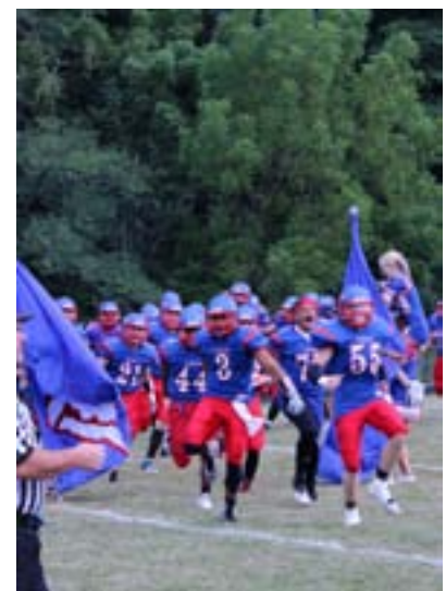
The football team charges onto the field ready for another home game.

The football team went to Rushville Industry on September 11th. They lost 21-34. It was not a fair game, but that is okay. They still went out and fought their hardest during that game to try and get that victory. September 18th was our annual white out night at home. The game was against South Fulton, and even though it stormed all the way up till kickoff, the football team won 26-8, so now that leaves them 2-2 going up to face Lewistown on Friday, September 25th. Please come out and support your Heights- Quest family!