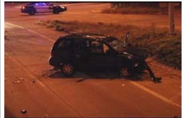
The case ended here on the Knoxville exit ramp after racing through Creve Coeur and East Peoria.

The chase started in Creve Coeur at the Lucky Break Tavern and ended off I-74 on the Knoxville exit ramp. It all started with a simple call to the police for a disturbance, but when the police arrived, the suspects were getting into a black SUV. Police ordered them to stop, but they did not, so the chase was on. The chase traveled through Creve Coeur, through East Peoria, and across the river on I-74 to the Knoxville exit ramp. On the ramp, the suspects crashed and were apprehended and then taken to OSF St. Francis Medical Center with minor injuries.