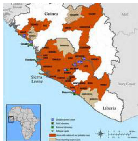
A map of the Ebola outbreak in Africa.

Have you heard of the new virus called Ebola? Ebola is an infectious and generally fatal marked by fever and severe internal bleeding, spread through contact with infected body fluids by a filovirus (Ebola virus), whose normal host species is unknown. It is spread through direct contact or with other objects like needles that have been contaminated. Ebola was discovered in 1976 near the Ebola River. Signs and symptoms of Ebola includes fever greater than 101.5°F and severe headache, muscle pain, vomiting, diarrhea, stomach pain, or unexplained bleeding or bruising. Symptoms may appear anywhere from 2 to 21 days after exposure, although 8 to 10 are most common. Back in March, an outbreak of Ebola was found in the forest region of Guinea. It spread into Sierra Leone, Liberia, and Nigeria. It has been found in several African countries and it has not been found in the United States. The CDC has deployed several teams of public health experts to the West Africa region and plans to send additional public health experts to the affected countries to expand current response activities from the U.S.