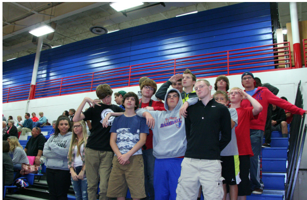
Members of the Red Storm recently came out to a volleyball game.

Keep reading the Town Crier for more information.