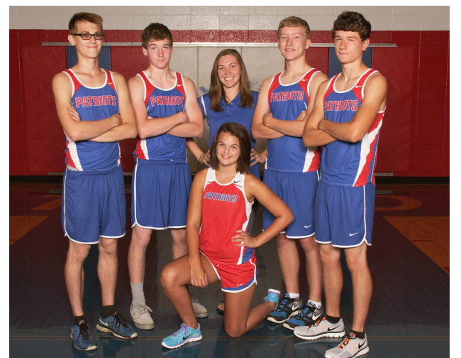
The 2014 cross country team.