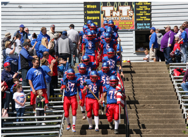
The Patriots venture through the crowd, as they take the field.