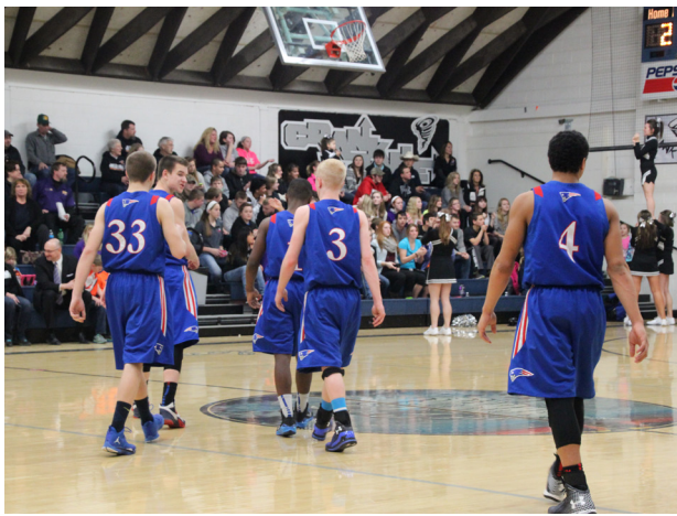
The Patriots walk out of their huddle at West Prairie.

On Friday, the Patriots fell at Abingdon. It was a tough loss for the team, as they were trying to keep pace with Brimfield and Elmwood at the top of the conference standings. The Patriots will be busy again this week. They will be at Havana on Tuesday, and they will host Bushnell on Friday. It is alumni night, and the Red Storm theme is a blackout.